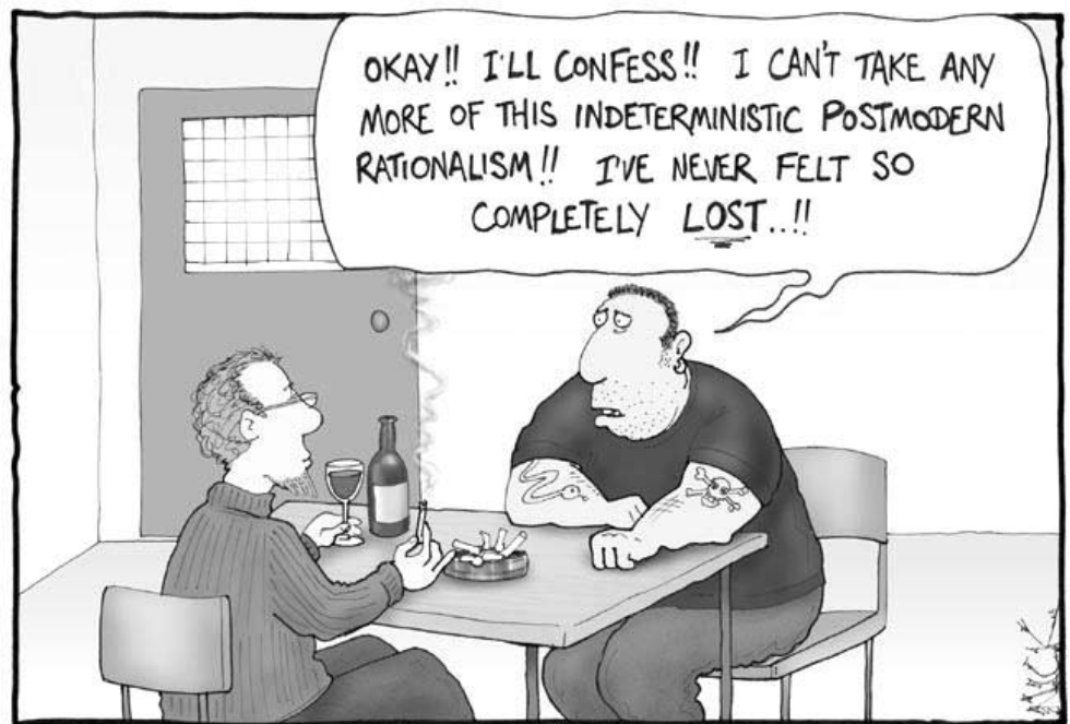
WHEN THE GOOD COP - BAD COP ROUTINE NO LONGER GETS RESULTS, YOU KNOW WHO TO CALL. POSTMODERN COP.

Contents are Copyright © 2007 the Skeptics Society and the authors and artists. Permission is granted to print, distribute, and post with proper citation and acknowledgment. ☞