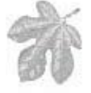
FIG Leaves P.O. Box 53174 Cincinnati, OH 45253

June Meeting Sun. June 29, 2008 2:00 PM July Meeting Tues. July 22, 2008 7:00 PM