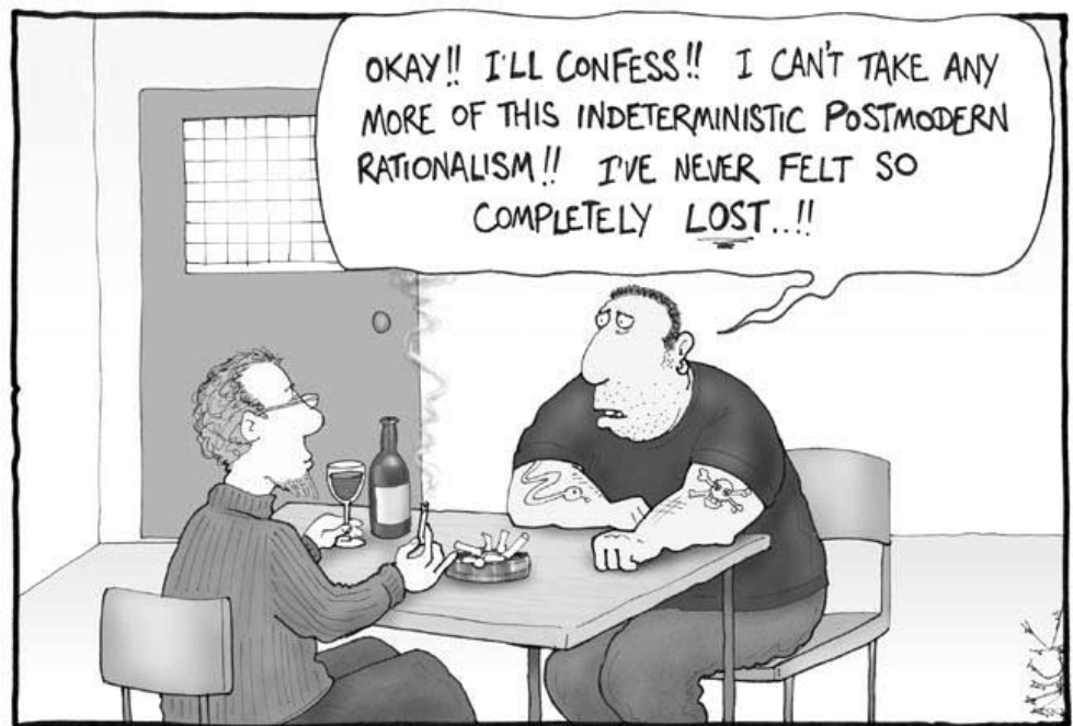
WHEN THE GOOD COP - BAD COP ROUTINE NO LONGER GETS RESULTS, YOU KNOW WHO TO CALL. POSTMODERN COP.

Contents are Copyright © 2007 the Skeptics Society and the authors and artists. Permission is granted to print, distribute, and post with proper citation and acknowledgment. ☞